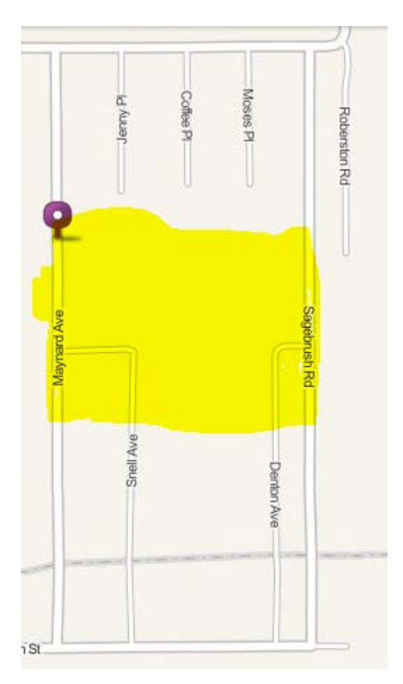
Map Details: Housing Community from 7<sup>th</sup> to 9<sup>th</sup> Streets between Maynard and Sagebrush