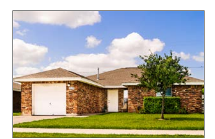
Arbor Cove in Donna, Texas.