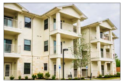
Oak Creek Townhomes in Marble Falls, Texas.