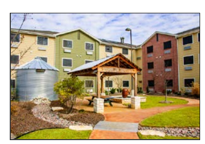
Spring Terrace Apartments in Austin, Texas.