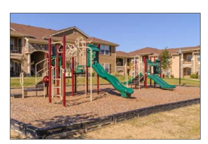
Tuscany Park at Buda in Buda, Texas.

9% HTCs, which pay for about 70% of a development and are highly competitive based on their value to developers and equity providers.