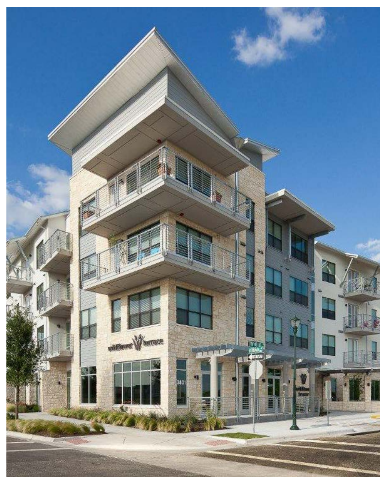
Wildflower Terrace in Austin, Texas

A Guide for Local Engagement on Affordable Housing Development