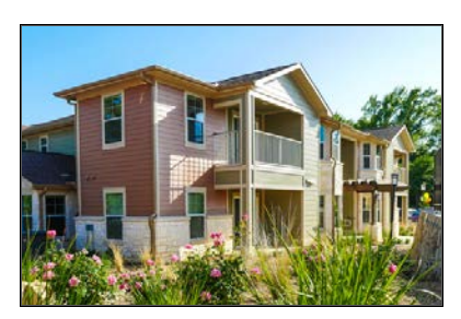
Amberwood Place in Longview, Texas.